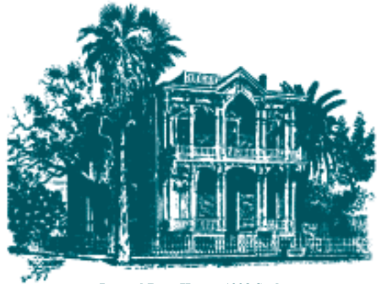
Lemuel Burr House, 1228 Sealy

102. 511 17th Street, Isaac Heffron Home, 1899. Prominent cement contractor Isaac Heffron had Charles W. Bulger design the red brick house reminiscent of an Italian villa. Surrounding the grounds are the original walls and gates.