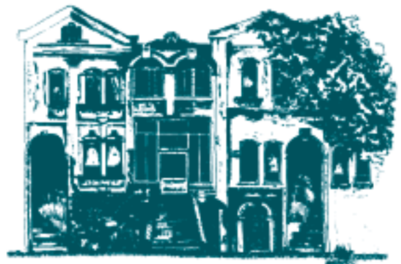
Lucas Apartments, 1407 Broadway

34. 1412 Sealy, August J. Henck Cottage, c. 1893. Notable features in this ornate Victorian cottage are the stained glass windows on the bay window.