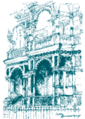
Sonnentheil House, 1826 Sealy