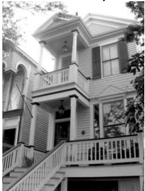
After repair of storm damage