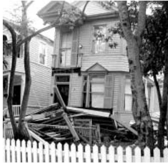
1823 Winnie - May 2005