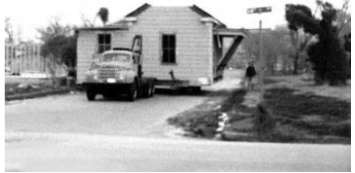
COTTAGE ON IT'S WAY TO NEW SITE - 1979

Shortly after demolition of the old Cordray Drugstore, Jake Posnick donated a small home located at University Blvd. and Market Street. The building was moved to it's new site in 1979.