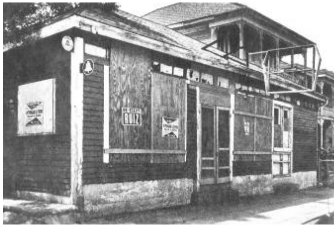
1501 Postoffice –CORDRAY DRUGSTORE - 1975

In the year following the Civil War, a building was constructed on the site and used as a carpenter's shop and later housed a grocery store. In 1918, it was purchased by Pharmacist. Edmund Joseph Cordray,