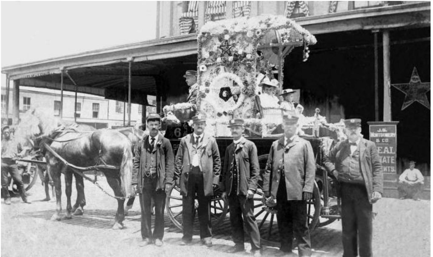
This year's Children's Mardi Gras Parade wasn't Galveston fire fighter's first parade