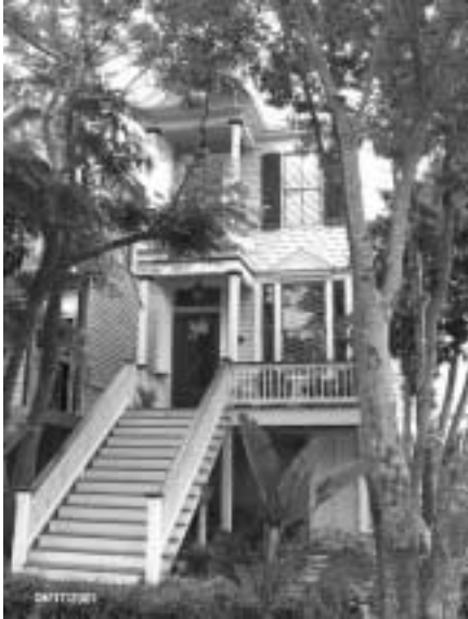
1823 Winnie, 1893

The real estate investor, H. M. Trueheart seems to have built this high raised, side-hall plan house as a tenant house. Despite the narrowness, it is sheathed with shingles, including a flared skirt of shingles beneath the second floor windows, to advertise middle-class respectability. The picturesquely detailed porch and especially the way the west-side wall is inset to allow access to light and air, suggest the hand of C. W. Bulger.