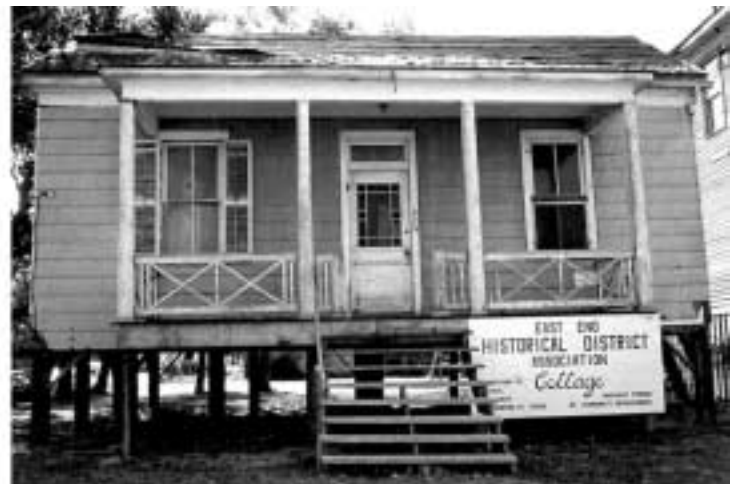
Jake Posnick & EEHDA Pres. Sally Robinson at 620 Market Named "The COTTAGE", after it's move to 1501 Postoffice

Also, did you know this? Everyone who owns historic properties should have a windstorm exemption for each structure on their property. This exemption allows for damaged property to be replaced with "in-kind" elements instead of replacing at current city building code requirements. In addition, if your building is over 50% damaged in a storm, and the property is not exempt, you may not rebuild the structure. Similarly, buildings severely damaged in a flood that are not covered by the exemption must be raised to meet new flood plain codes. If you didn't know or haven't had the chance, Galveston Historical Foundation has a new website, www.galvestonhistory.org . Check it out. You can find windstorm exemption forms as well as other great information on the new site. There's lots of great information regarding historic preservation, including a link to lost properties on the island. The new site explains, in words and pictorially, why we do what we do to preserve and restore properties in Galveston. You will also find links to other programs and events hosted by GHF.